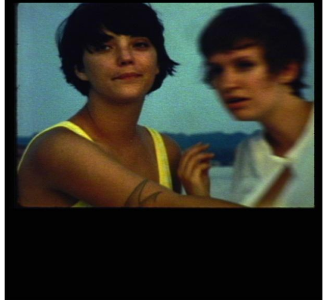
Are You There? Yes. Are You There? Yes. (detail, two images)