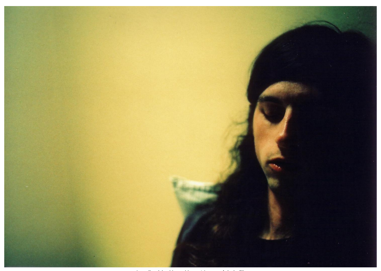
I called to You Your Name (detail)