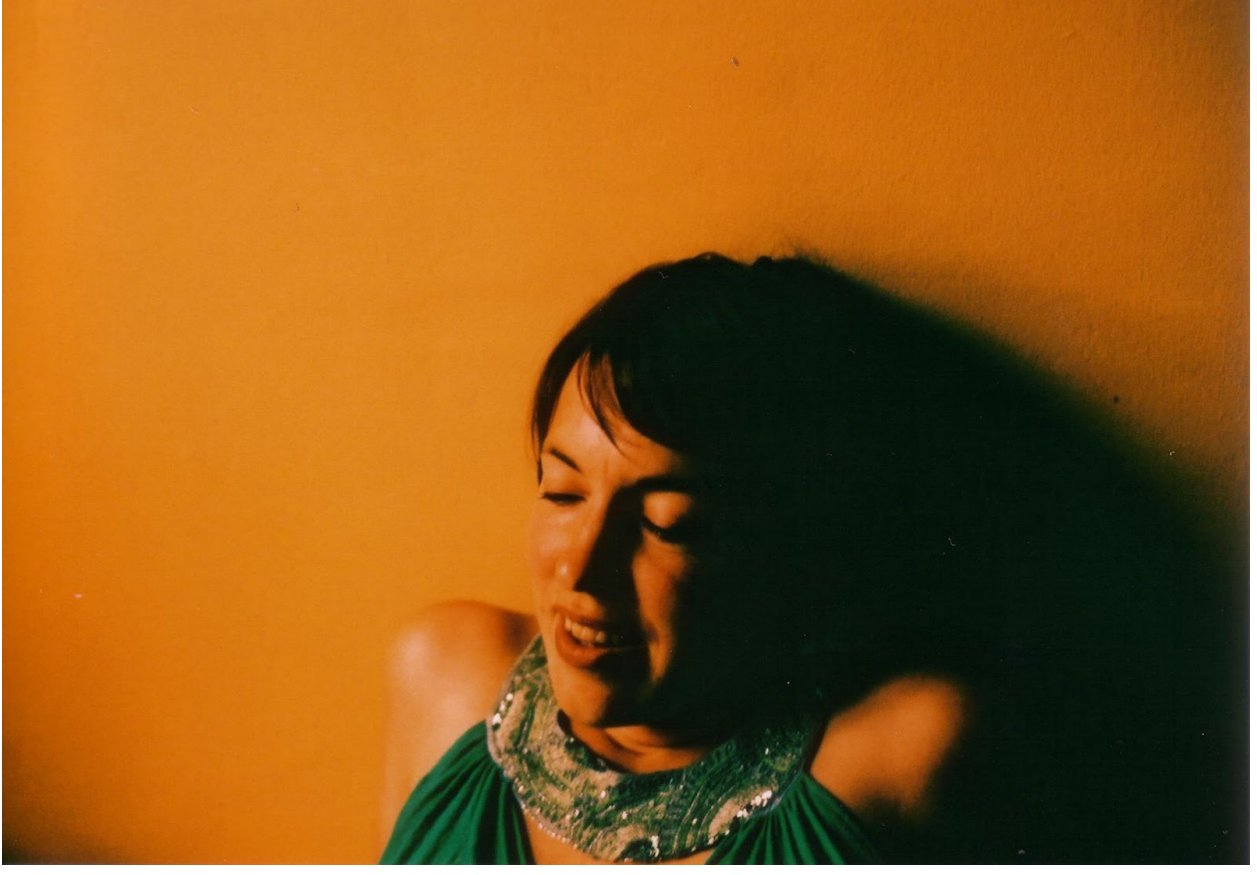
I called to You Your Name (detail)