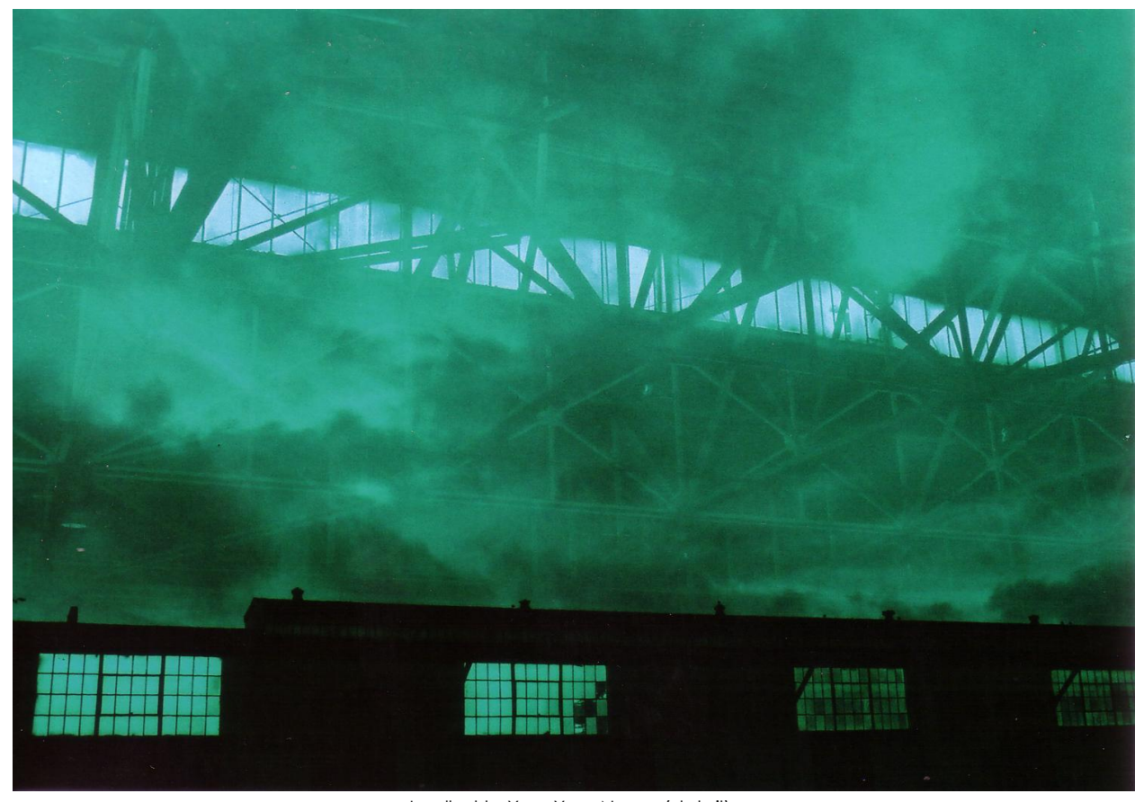
I called to You Your Name (detail)