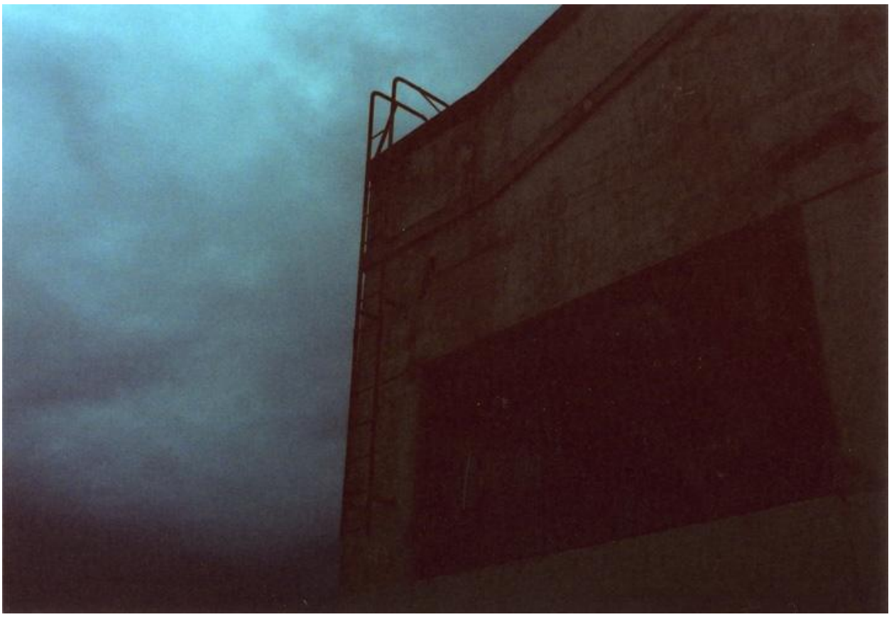
I called to You Your Name (detail)

A series of photographs shot by the artist and altered by adding hard-to-see text, then installed on a wall where text was visibly covered over with paint. The photograph essay obscures and reveals interiority with the use of text and image. The act of deconstructing a fabricated reality requires a complex language – language, which is a site for social, cultural and political traces. In "I Called to You Your Name," a voice that has been repeatedly silenced establishes ways to be heard while protecting itself.