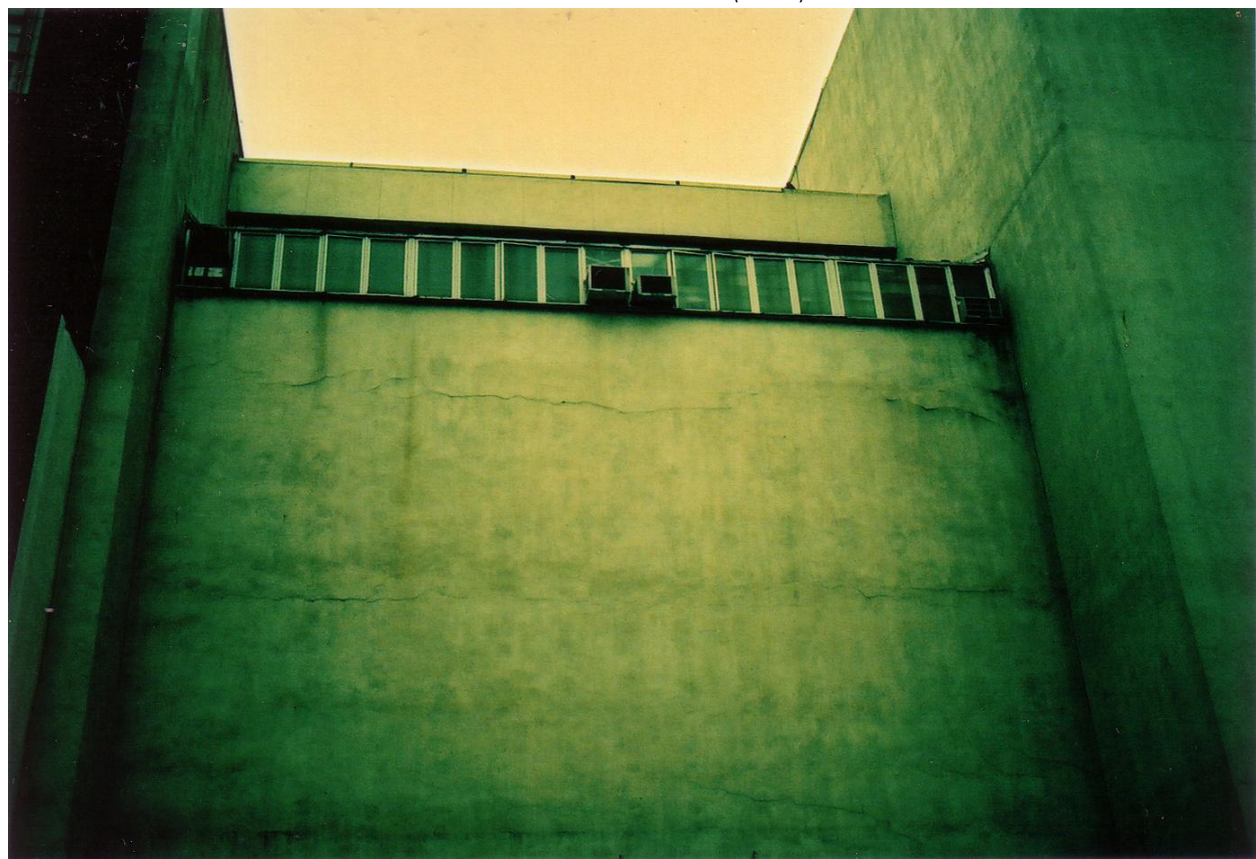
I called to You Your Name (detail)